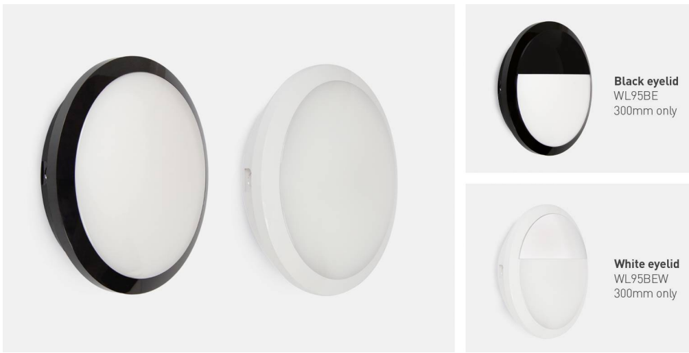
Black eyelid WL95BE 300mm only